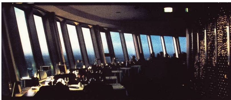
FIGURE 9. Tacita Dean, Fernsehturm , 2001, 16mm color anamorphic film with optical sound, 44 mins. © courtesy of the artist, Frith Street Gallery, London and Marion Goodman Gallery, New York and Paris.

The strong thematic link in Dean's work between the sea voyage and chance is clear, but the question that concerns me is how this bears on her use of photography as a medium. Part of Disappearance at Sea II shows the beam of light from a lighthouse panning across the dark sea (fig. 8). This shot creates an effect similar to a film technique called the blind pan, a term that refers to a sweep across the field of vision without focal point or object. Although it is not about the sea, her film Fernsehturm (2001) is similar in