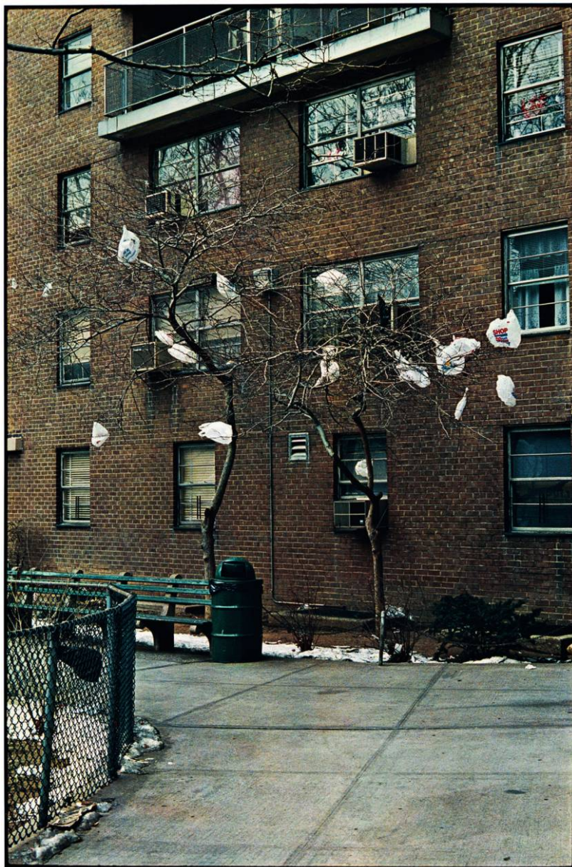
FIGURE 3. Zoe Leonard, Untitled (tree + bags) , 2000 (detail). © the artist, courtesy of Galerie Gisela Capitain, Cologne.