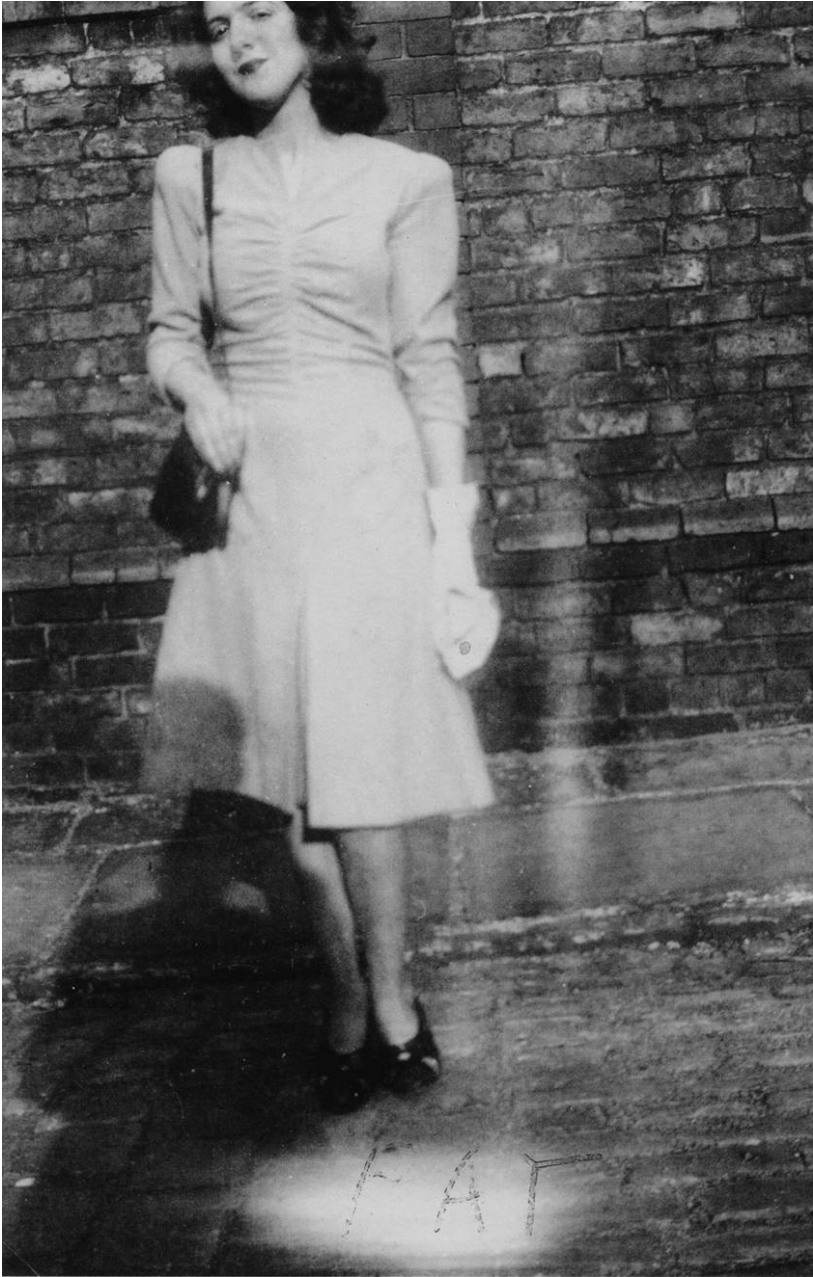
FIGURE 7. Tacita Dean, image from Floh , Steidl Books, 2001. © courtesy of the artist, Frith Street Gallery, London and Marion Goodman Gallery, New York and Paris.