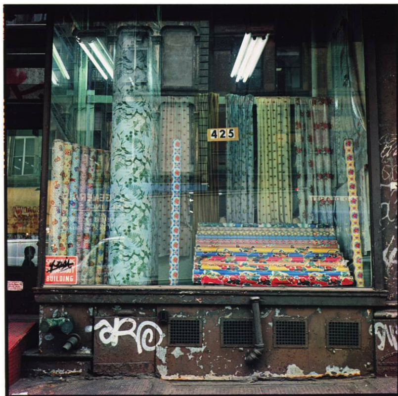
FIGURE 1. Zoe Leonard, Analogue , 1998 and 2007 (detail). © the artist, courtesy of Galerie Gisela Capitain, Cologne.

and Fuji clearly visible. She usually hangs them under glass with no frame or mat. The familiar square format of the prints, 11 in. x 11 in., recalls pictures taken by classic analogue film cameras, like the old Rolleiflex she in fact used. They are also of modest size, although the full installation of all 412 prints, as was seen at Documenta XII in 2007, is monumental in scale. The impetus for the project, which involved a decade of work and thousands of pictures, was the gentrification of her neighborhoods in the Lower East Side of New York and in Brooklyn. The old linoleum store and local butcher were making way for new clothing boutiques and bars. Yet it was only at the point when “the layered, frayed and quirky beauty” of her neighborhood was on the point of disappearing that she realized how much she loved and depended on it. 26 Although Analogue moves out from