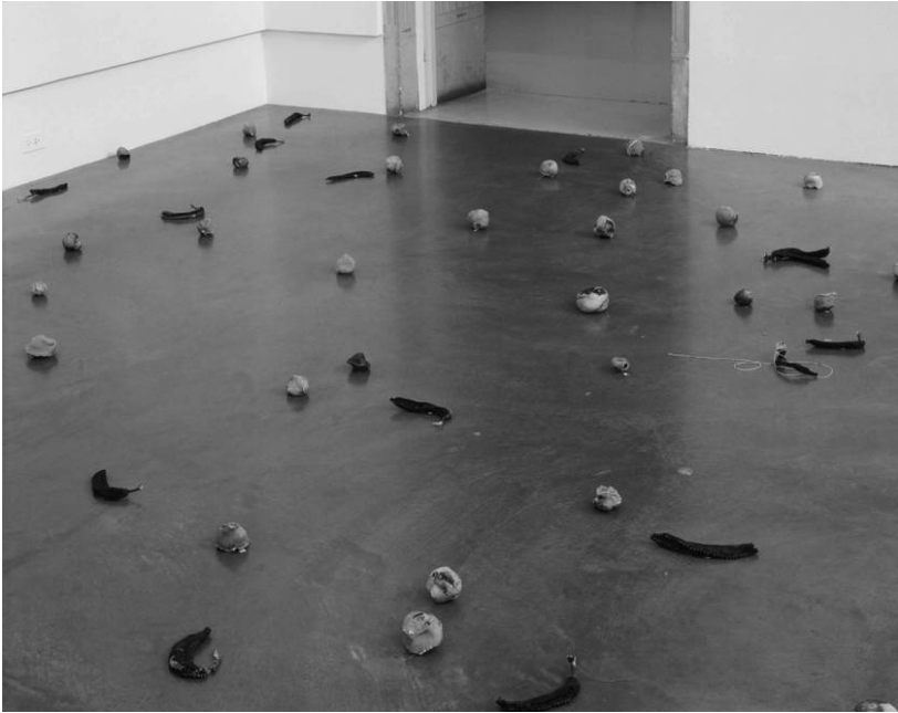
FIGURE 5. Zoe Leonard, Strange Fruit (for David) , 1992–97 (installation view, Philadelphia Museum of Art). © the artist, courtesy of Galerie Gisela Capitan, Cologne.

with the appearances in a snapshot.” This allowed him “to focus his life in the moment rather than hurrying on past it.” 38 Yet if this sort of photography is allied to sculpture, it is the sort of sculpture that is lined with absence, like Leonard’s hollowed-out fruit skins or suitcases.