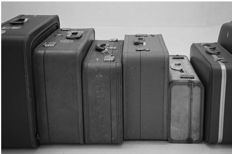
FIGURE 2. Zoe Leonard, 1961 , 2003. © the artist, courtesy of Galerie Gisela Capitain, Cologne.

accident.” Orozco makes the link, crucial for my argument, between receptivity and chance. 29