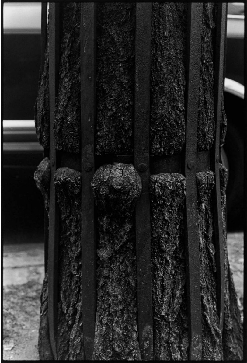
FIGURE 4. Zoe Leonard, ( tree + fence ), 1998–99 (detail). © the artist, courtesy of Galerie Gisela Capitain, Cologne.