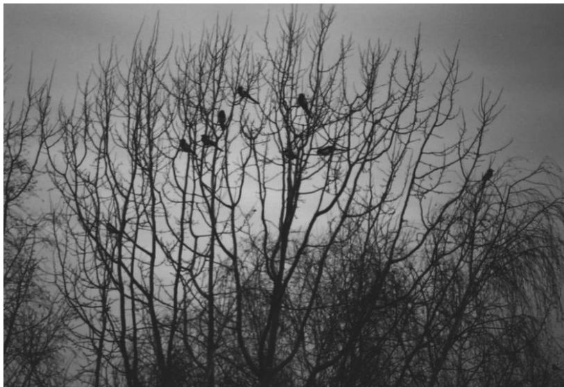
FIGURE 6. Tacita Dean, Pie , 2003, 16mm color film with optical sound, 7 mins. © courtesy of the artist, Frith Street Gallery, London and Marion Goodman Gallery, New York and Paris.

Dean is even more outspoken than Leonard in her stand against the digitalization of everything. In the introduction to the catalogue for the exhibition, Analogue , she declares that analogue is a description “of everything I hold dear.” She points out that analogue refers to a vast range of things, from the movement of hands on a watch to writing and drawing. She continues, “analogue implies a continuous signal—a continuum and a line, whereas digital constitutes what is broken up, or rather, broken down, into millions of numbers.” While the convenience of digital media is wonderful, she confesses: “for me, it just does not have the means to create poetry; it neither breathes nor wobbles, but tidies up our society, correcting it and then leaves no trace.” It is not “born of the physical world.” We are being “frogmarched,” she declares, into a digital future “without a backward turn, without a sigh or a nod to what we are losing.” 39 I can’t help hearing in this last phrase an echo of the tragic myth of Orpheus, who descends into the underworld to rescue his dead wife, but, leading her back to safety, he anxiously turns around and in so doing loses her again. Dean’s posture as an artist is just this turning around out of fear and love. As a sort of elegy for analogue film, Dean made a film of a French Kodak factory in operation shortly before it was to cease producing celluloid film